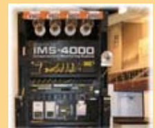
Remote Monitoring System