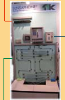
Water Detection System